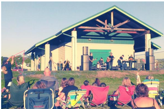
Bubbles and Crème Tangerine entertain

The second season of free Thursday evening music concerts in the park brought new acts as well as a familiar and popular act from last year, Crème Tangerine! The free music concerts were presented by the Snohomish Artist Guild, who secured community sponsors from Walmart, Valley General Hospital, Emeritus Senior Living, The Monroe Monitor & Valley News, Teamster Local 117 and Evergreen Printing & Graphics. We hope to host these fun community concerts again in 2015.