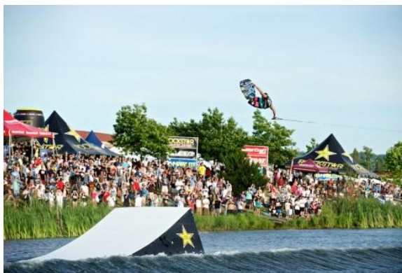
MasterCraft Pro Tour stopped in Monroe for a 4 th year