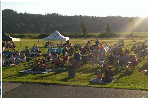
Crowds are growing for free music concerts