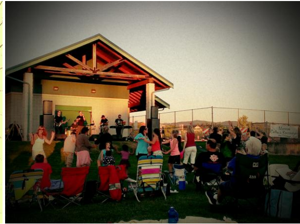
Dancing to the music