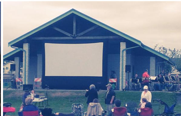
New larger screen!