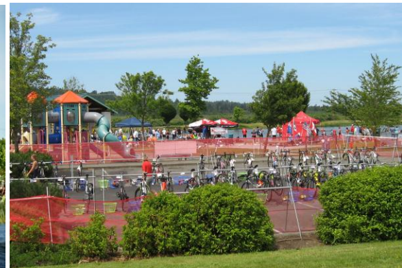
Lake Tye Park full of U.S. Olympic triathletes!