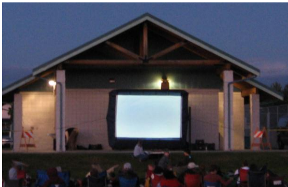
Old movie screen

Special thanks goes out to Republic Services, who not only sponsor the movie licensing for all of the free movie showings each year, but for donating funds this year to purchase a new and much larger movie screen! This event series has become an annual tradition in our park each Friday night in August. The crowds, now averaging 400-500 people, have outgrown the smaller screen, so the new screen enhances the experience for all the moviegoers. Movies Under the Moon is put on through a partnership between the Monroe Parks & Recreation Department, Monroe Arts Council, Monroe Family YMCA, Monroe Schools Foundation, Concessionaire Neucon Ent. and the Monroe Community Band.