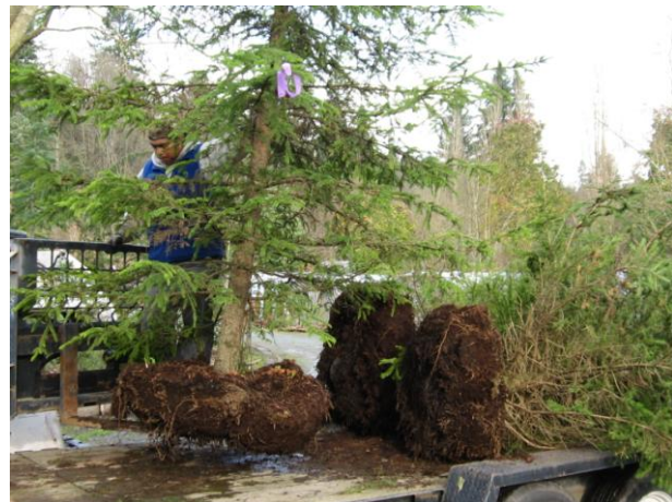
Loading donated trees @ Woods Creek Nursery