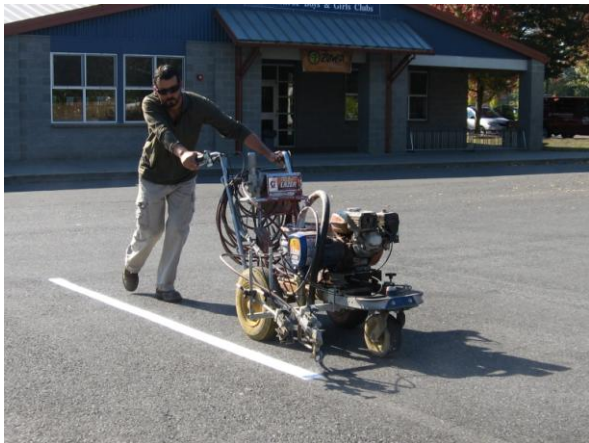
Re-striping parking lot @ Boys & Girls Club