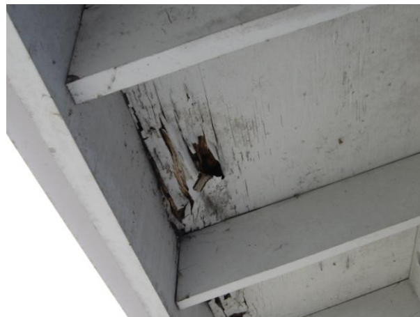
Water damage to roof @ Sky River Park