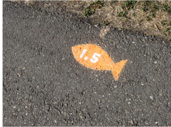
New trail distance markers @ Lake Tye Park