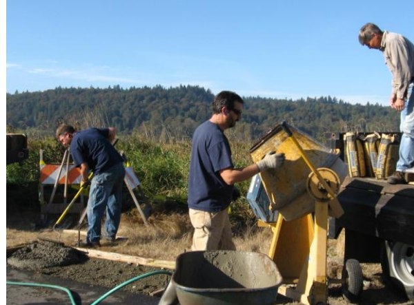
Pouring concrete pad for donated bench @ Lake Tye