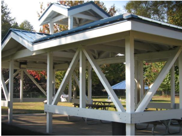
Freshly painted shelter @ Sky River Park