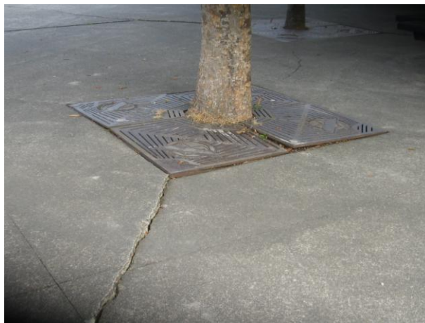
Lifted concrete and tree grates from tree roots