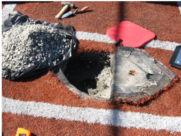
Home plate repair at Rotary Field

Canine Parvovirus Notice The Department posted notices at Wiggly Field, Sky River Park, Lake Tye Park, City Hall and on the City website to give the public information about the recent spike in canine parvovirus cases in the state. While no cases have been confirmed in our immediate area, dog owners are encouraged to consult with their veterinarians about risks in public areas and to keep their pets current with all vaccinations.