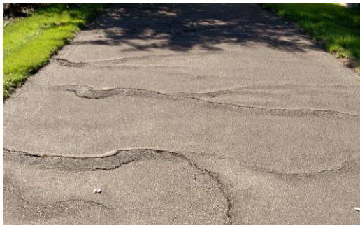
Trail repairs before

City of Monroe O&M staff repaired over 300 feet of 10' wide parks trails that had been damaged by tree roots. The repairs were made to segments of public trails located south of Rainier View Road and northeast of Currie Road.