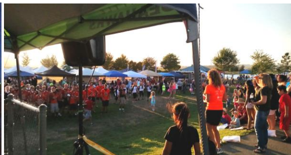
National Night Out Against Crime