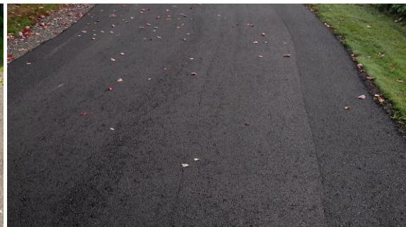
Trail repairs after