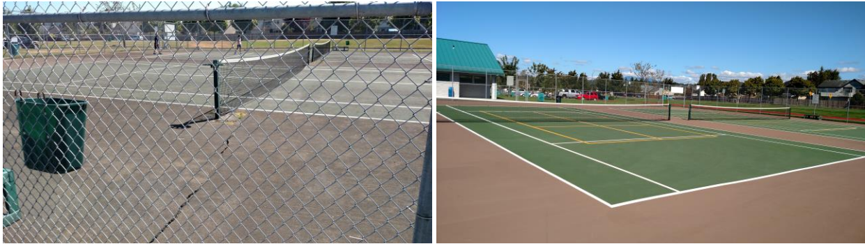
Lake Tye Parks Tennis Courts Before & After

The tennis courts and basketball courts at Lake Tye Park and Wales Street Park have been resurfaced. The tennis courts have additional lines striped for paddleball courts as well as traditional tennis, recognizing the growing popularity of this game, especially among senior citizens. The City contracted with Combined Construction, Inc. to complete the $34,848.00 Parks capital improvement project.