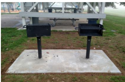
Eagle Scout project