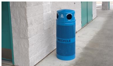
New recycle bins thanks to a Coca-Cola/Keep America Beautiful grant award