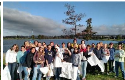
Sky Valley Education Center volunteers