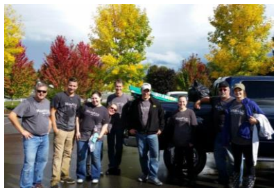
MainVue Homes volunteers