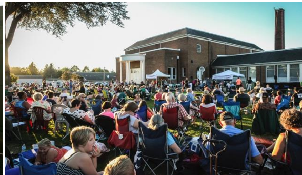
2015 Swift Night Out event