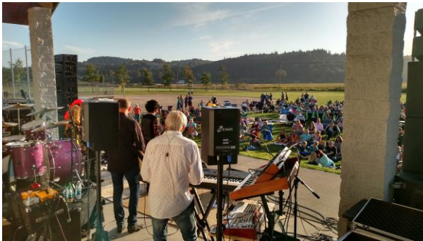
Heart By Heart free concert in the park

The summer schedule of events and programs have wrapped up for the year, and what a year it has been! From sporting events and tournaments to youth day camp programs, there has been much to do and experience in our parks. Free music concerts and outdoor movies in the park at Lake Tye, Fair Days Parade, Swift Night Out and so much more. Our community calendar has been packed with fun and exciting outdoor programs and events. The Adventure Starts Here in our parks, trails, community facilities and downtown, providing unique recreation and event experiences for residents and visitors of all ages to enjoy!