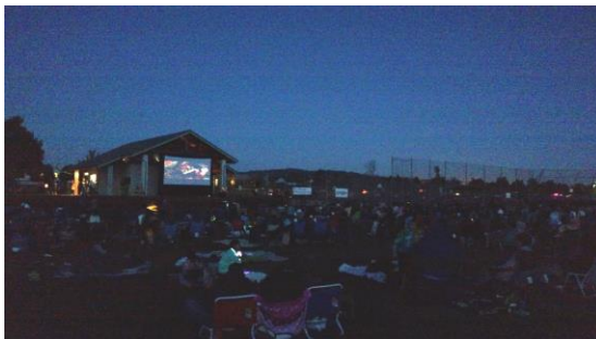
Movie Under the Moon