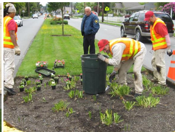
Inmates from MCC planting flowers (file photo)