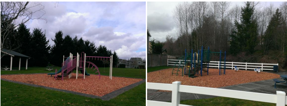
New Playground surfacing chips at Stanton Meadows & Ramblewood Parks

Parks and Recreation Department team members have been busy this winter with daily recreation use of our parks facilities, as well as scheduled winter maintenance and repair work on equipment and landscaped areas. The crew has begun working on several parks capital improvements as well. New playground surfacing chips are being installed, dugout covers, extra backstop netting and new infield surface mix are underway for the ballfields. Staff is also busy working with community partners in planning a full slate of events and programs for 2015, as well as working on the Park Plan update as part of the City's 2015 Comprehensive Plan Update process.