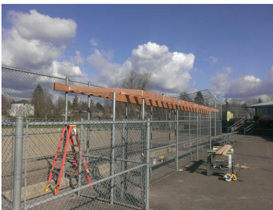
Constructing dugout covers @Sky River Park

Event planning work includes Egg Hunt on April 4 at Lake Tye Park, Sky Valley Little League Jamboree (4/18), Kids Fishing Day (4/26), a return of Skyhawks youth sports camps, Triple Crown Sports Memorial Day Tournament (5/24-26), INT Dust off the Rust Wake & Ski (6/6-7), the Tri-Monroe Triathlon (6/20), four Legends Baseball Tournaments (6/13-14, 6/20-21, 7/11-12, 7/25-26) and much more. The Pro Wakeboard Tour event will not be able to come to Monroe this July, but intends to return in 2016. New this year is the return of the NSA Western World Series (7/15-19), which last occurred here in 2006! Model boat races, dog agility events, ultimate Frisbee, lacrosse, youth baseball, soccer, 5K runs, movies, music concerts and so many more events are coming here this year.