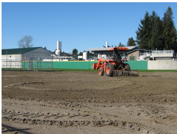
Working in new infield mix @Sky River Park