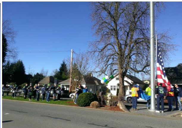
Smiley Creswell raising 12-Man flag