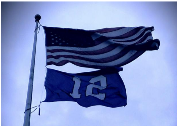
12-Man flag loaned by Seattle Seahawks