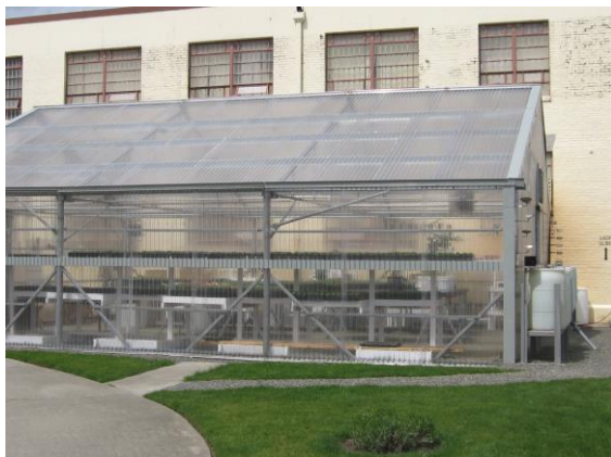
Greenhouse at Monroe Correctional Complex

We continue to partner this year with the Monroe Correctional Complex on projects that benefit the community and both organizations. Inmates have begun raising 4,000 flowers from seed at the prison for use later this spring on the ends of the traffic islands along Main Street and Lewis Street. This will be the 6 th year of partnering on the flower program, which is a cost saving measure for the City. In addition, we have scheduled to utilize DOC work crews again to assist with maintaining public right of ways in the City.