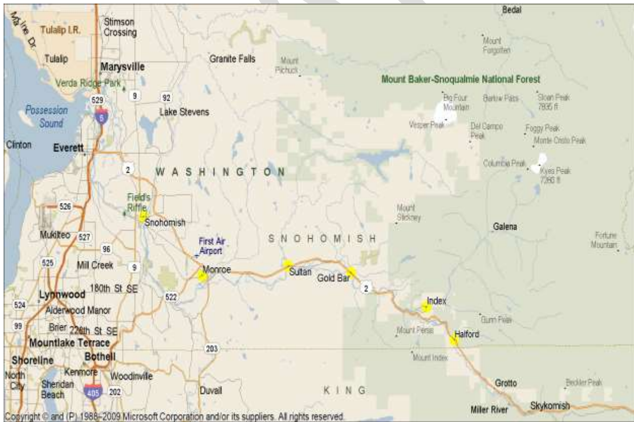
Figure 1. Map of Sky Valley, Washington centered around City of Monroe