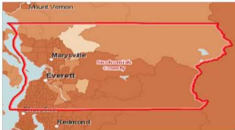
Foreign-Born Population (Non-Citizen or Naturalized), Percent by Tract, ACS 2015-19